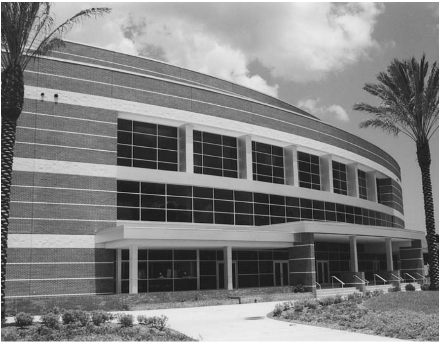
The Mary McLeod Bethune Performing Center International Speedway Boulevard Dedicated: September 2003