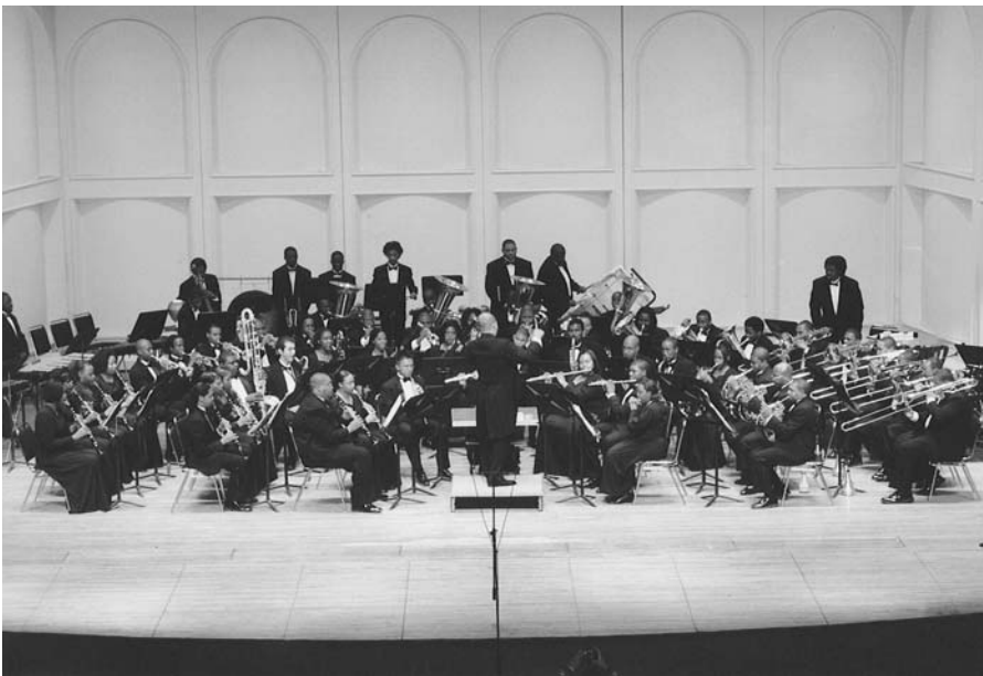
The Bethune-Cookman College Concert Band