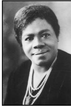
Dr. Mary McLeod Bethune (1875-1955) Founder and President (1904-1942; 1946-1947)