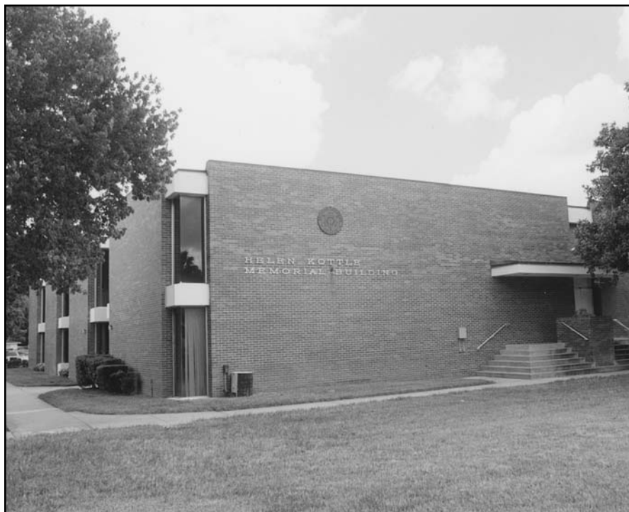
Helen Kottle Memorial Building School of Education