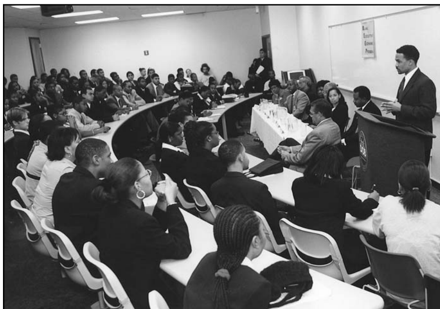
Black Executive Exchange Program (BEEP) Symposium