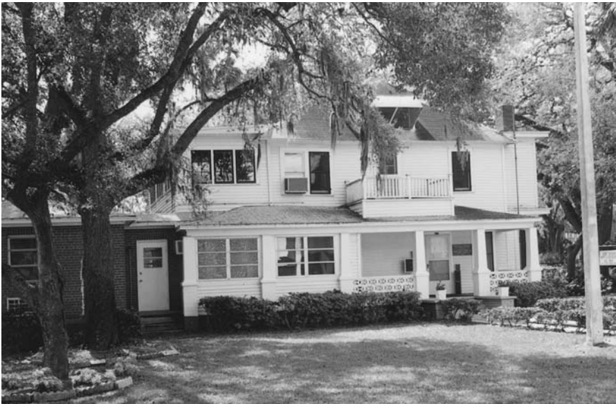
The Bethune Foundation

The Mary McLeod Bethune Foundation, built about 1914 on the Bethune-Cookman College campus, is the home in which Dr. Bethune lived as founder and president and in which she died. The Foundation was designated a National Historic Landmark by the National Park Service of the U.S. Department of the Interior in 1975. On July 10, 1977, her 102nd birthday, a second marker was erected at the home by the Association for the Study of Afro-American Life and History in cooperation with the Amoco Foundation. Thousands of visitors who tour the Foundation each year are able to capture the greatness of this remarkable woman and to receive inspiration from the legacy she willed to the American public.