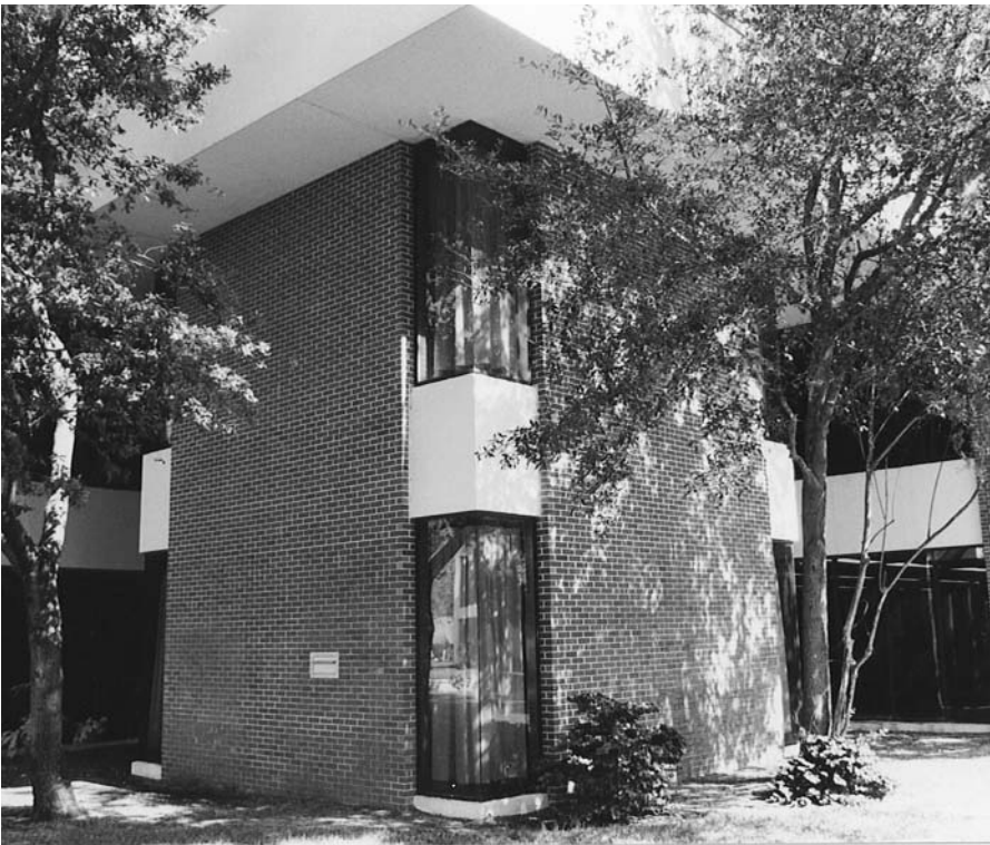
Carl S. Swisher Library/Learning Resources Center

Bethune-Cookman College is committed to the principles of equal employment opportunity in all phases of the employment relationship including advertising, hiring, compensation and other terms and conditions of employment without regard to race, color, religion, sex, national origin, age, disability, veteran's status, or marital status. The College is also committed to the principles of nondiscrimination in its educational programs and activities. No person shall, on the grounds of race, color, religion, national origin, marital status, age, disability or sex, be excluded from participation in, be denied the benefits of, or be otherwise subjected to discrimination in any program or activity of the College. Any employee or student who has a complaint regarding the College's compliance with these standards should contact the College's EEO Coordinator in the Office of Human Resources Management.