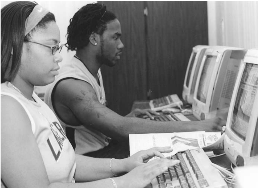
A Time to Study

An individual study of a topic or series approved in advance by the instructor and the School dean.