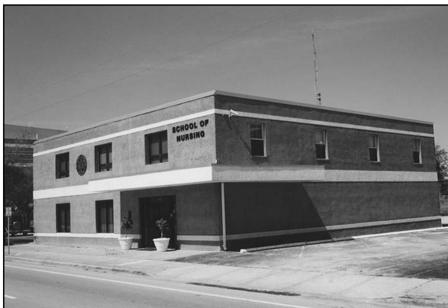
The School of Nursing Building International Speedway Boulevard