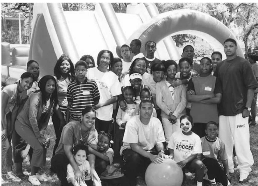
B-CC students serving the community's youth

A number of faculty and staff members have distinguished themselves and are renowned in their fields. As a consequence, faculty members are (a) listed in some of the most prestigious publications (including but not limited to Who's Who in American Education , and Who's Who in America ) and (b) are recipients of numerous awards and citations, such as keys to cities, and memberships in learned and honorary societies such as Beta Kappa Psi, American Chemical Society, Pi Lambda Theta, Phi Kappa Phi, and Phi Beta Kappa. Faculty members present papers and research findings at state and national meetings.