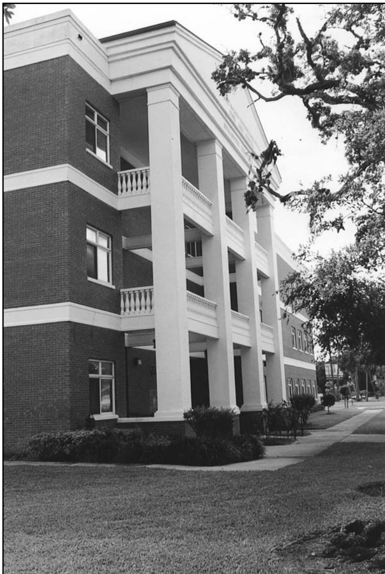
Fine Arts Building School of Arts and Humanities