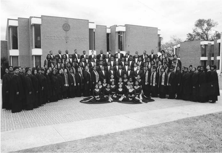
The Bethune-Cookman College Concert Chorale