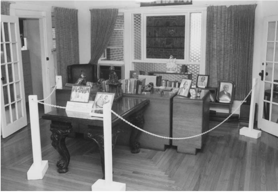
Inside the Foundation