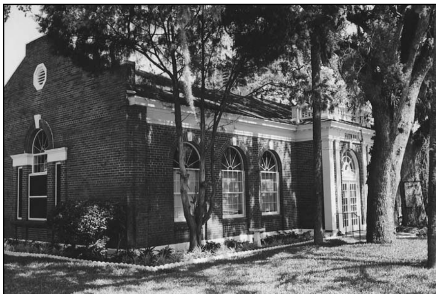
Faith Hall School of General Studies