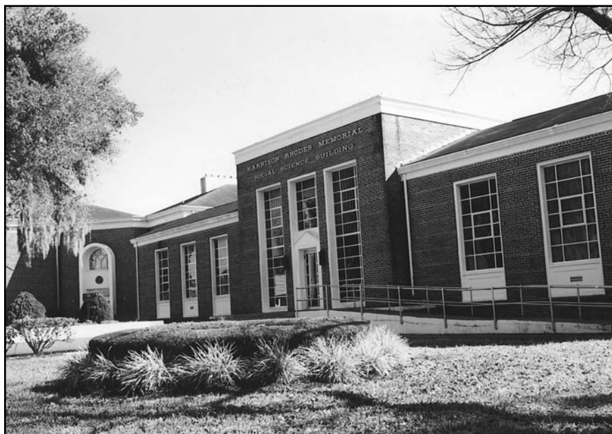
Harrison Rhodes Memorial Building School of Social Sciences