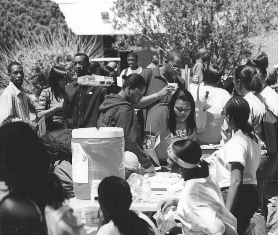
A Time to Socialize

in the Armed Forces, Public Health Services Corps, VISTA and similar volunteer organizations. Loan cancellation benefits are also available for borrowers who go into certain types of teaching institutions and other specified duties.