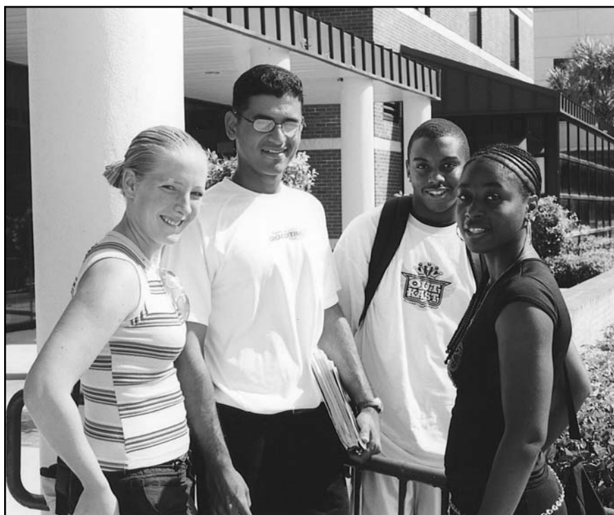
Welcome to the Campus