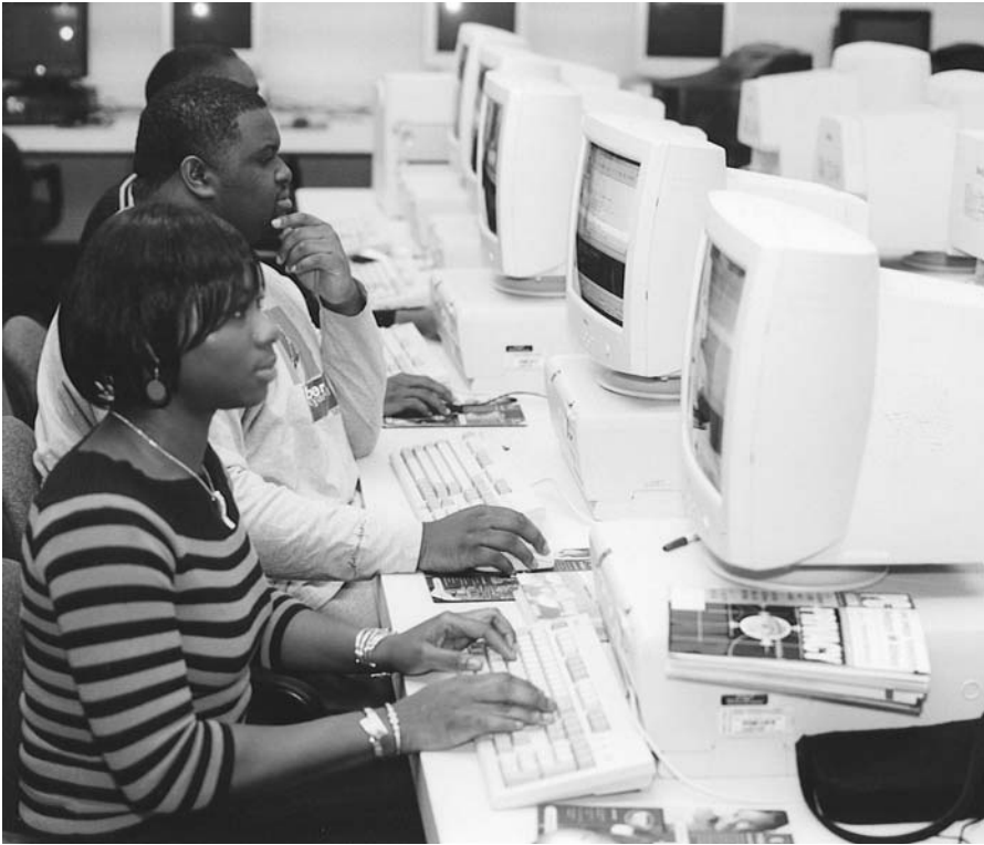
Computer Science Laboratory School of Science, Engineering, and Mathematics