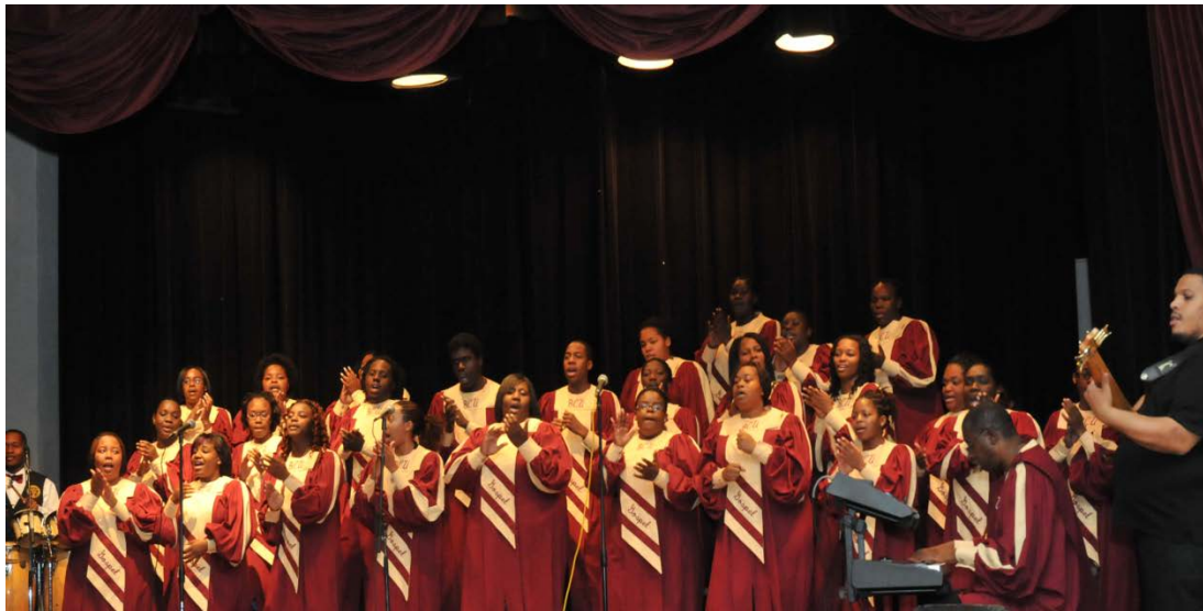
Bethune-Cookman University Inspirational Gospel Choir