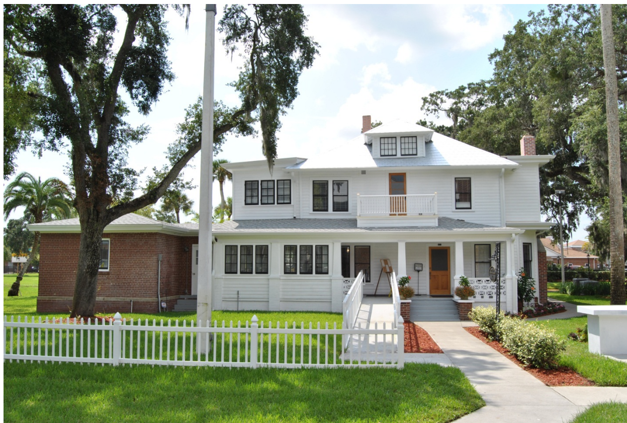
The Bethune Home

Built in 1905, the Mary McLeod Bethune home is where Dr. Bethune lived and conducted much of the official business of the college she founded in 1904. The grounds of Dr. Bethune’s home are also the location of her final resting place. A memorial gravesite and garden are located in close proximity to her home. The home was designated a National Historic Landmark by the National Park Service of the U.S. Department of the Interior in 1975. On July 10, 1977, her 102 nd birthday, a second marker was erected at the home by the Association for the Study of Afro-American Life and History, in cooperation with the Amoco Foundation. The site is also the 94th United Methodist Historic Site. The home currently serves as a museum and is visited by public and private school students, as well as, Native Floridians and national and international tourists. Visitors capture just a bit of the greatness of this remarkable woman and receive inspiration from the legacy that Dr. Bethune willed to the American public.