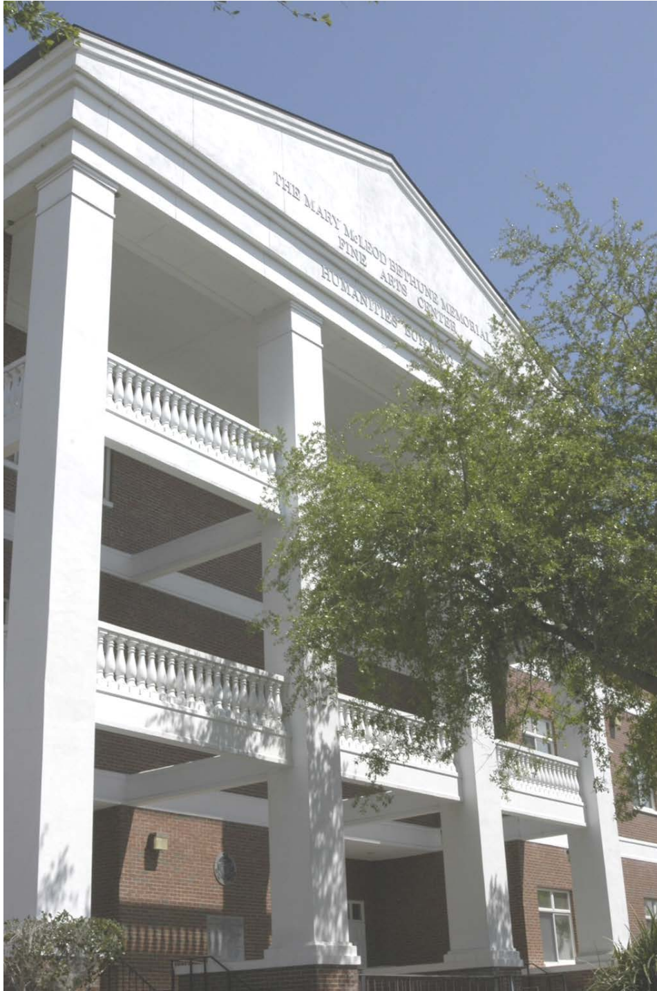
Fine Arts Building