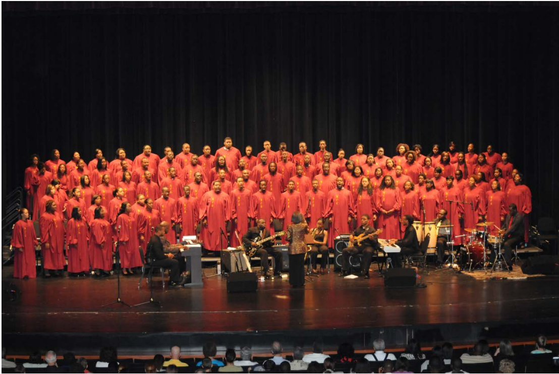
Bethune-Cookman University Concert Chorale