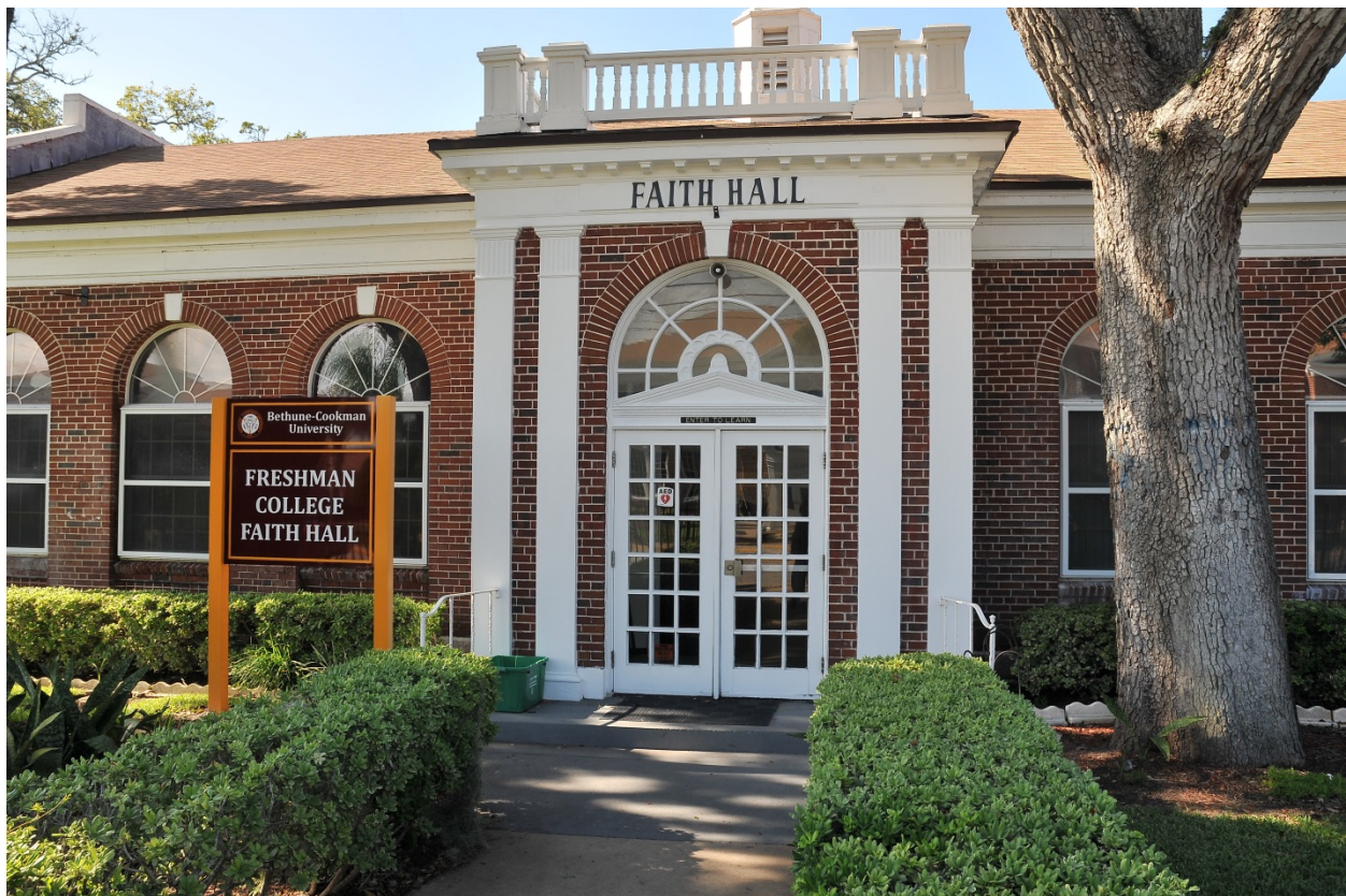
Historical Faith Hall; Administrative Offices for Freshman College

Information regarding academic programming at the University is found on the following pages. Additional information may be obtained from the deans and department chairs of each academic school. The University reserves the right to withdraw or modify any course or to change instructors of courses as deemed necessary. Class locations are included on the registration schedules that are provided to students each Semester and are posted on the University's website.