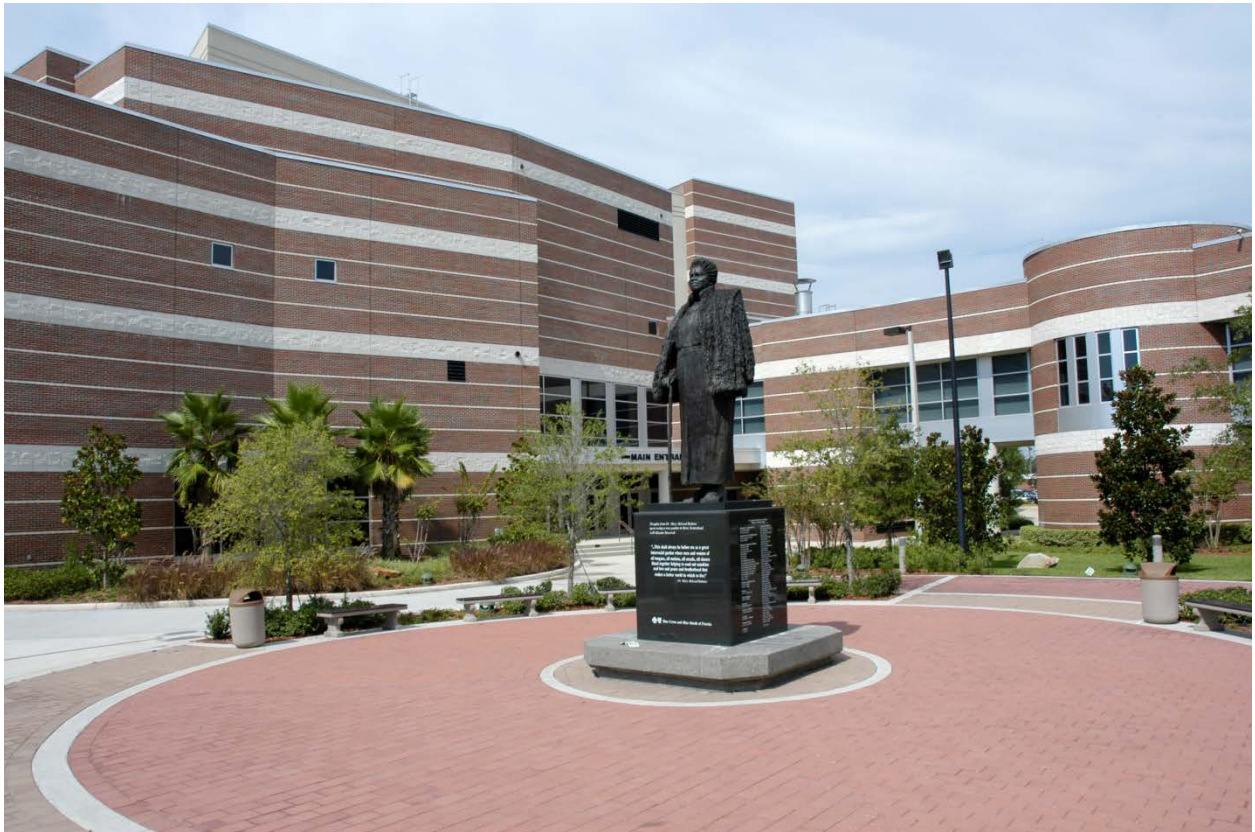
The statue of Dr. Mary McLeod Bethune is located in the Centennial Gardens on the Bethune-Cookman University campus.