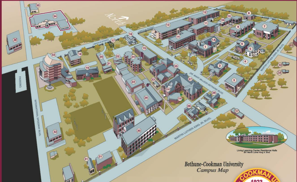
Bethune-Cookman University Campus Map