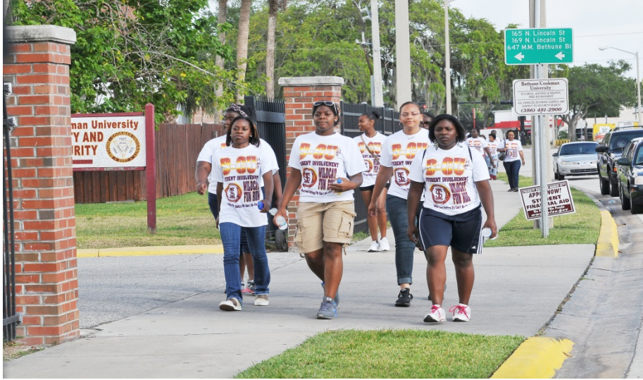
Wildcats getting fit with Fun Run