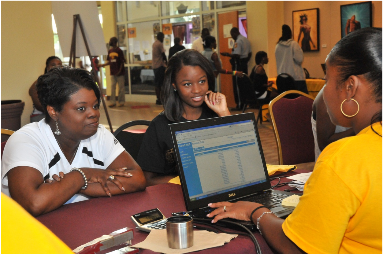
Students interacting with Financial Advisor during Registration