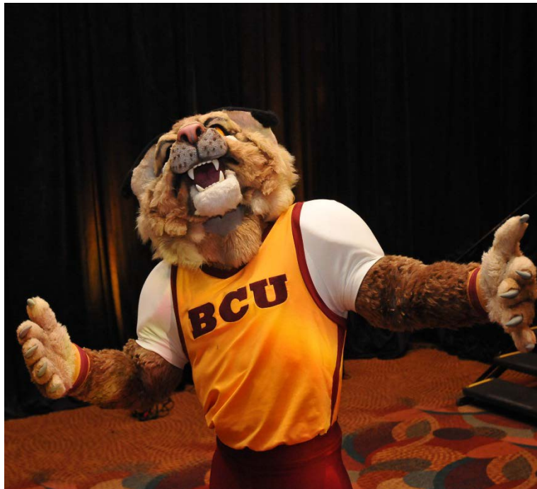
B-CU Wildcat Mascot