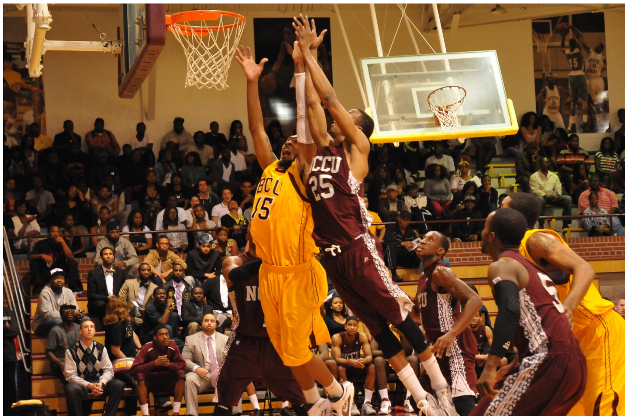
Wildcats in a Basketball Contest