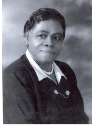
Dr. Mary McLeod Bethune (1875-1955) Founder and President (1904-1942; 1946-1947)