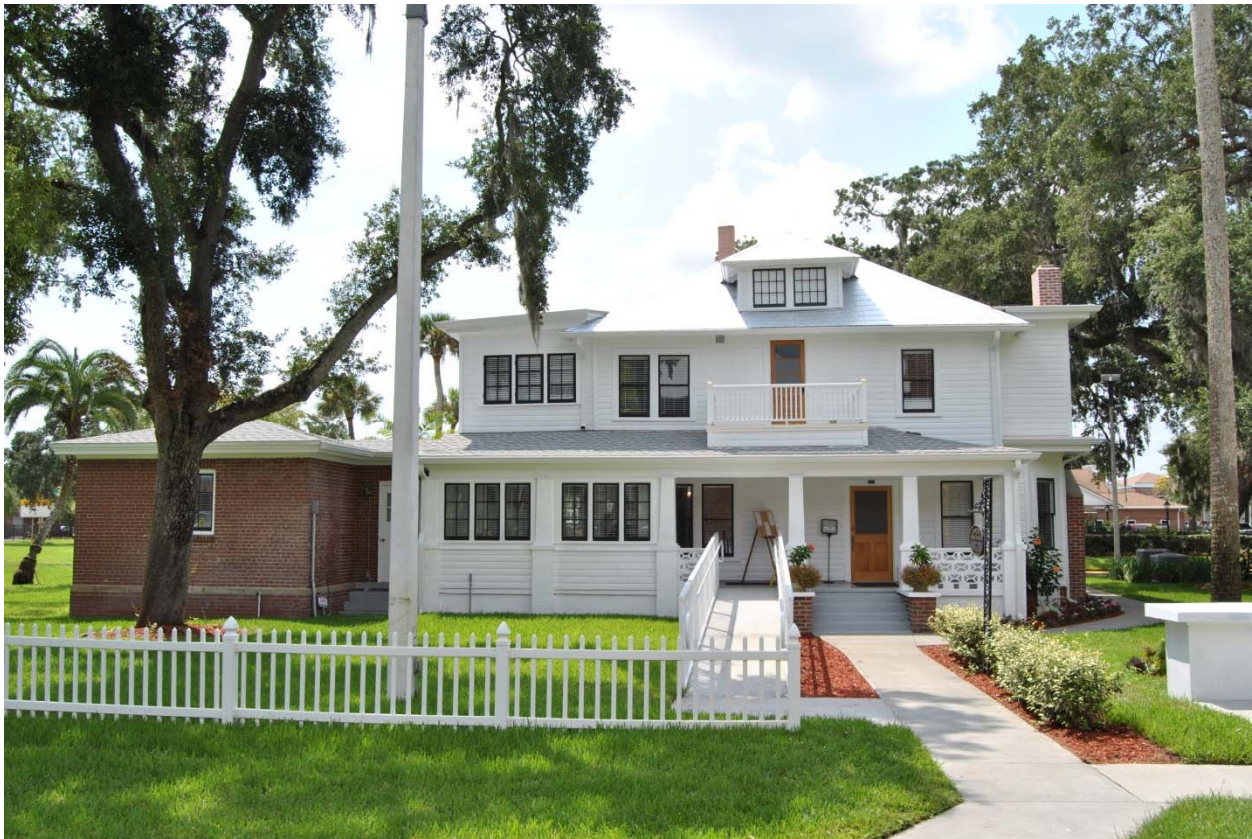
The Bethune Home

Built in 1905, the Mary McLeod Bethune home is where Dr. Bethune lived and conducted much of the official business of the college she founded in 1904. The grounds of Dr. Bethune’s home are also the location of her final resting place. A memorial gravesite and garden are located in close proximity to her home. The home was designated a National Historic Landmark by the National Park Service of the U.S. Department of the Interior in 1975. On July 10, 1977, her 102 nd birthday, a second marker was erected at the home by the Association for the Study of Afro-American Life and History, in cooperation with the Amoco Foundation. The site is also the 94th United Methodist Historic Site. The home currently serves as a museum and is visited by public and private school students, as well as, Native Floridians and national and international tourists. Visitors capture just a bit of the greatness of this remarkable woman and receive inspiration from the legacy that Dr. Bethune willed to the American public.