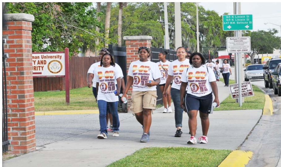
Wildcats getting fit with Fun Run

Among the services provided is graduate school counseling, a service by which students are advised on the process of applying for and obtaining graduate study.