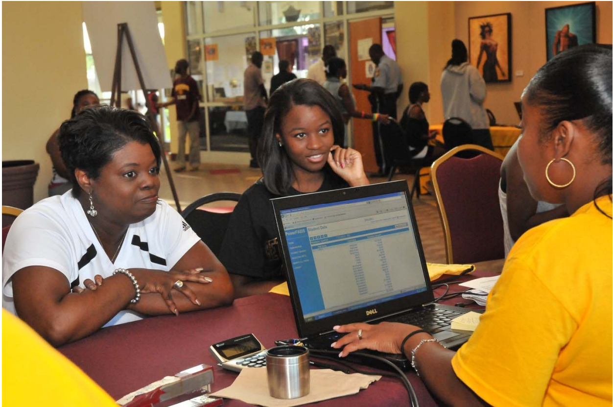
Students interacting with Financial Advisor during Registration