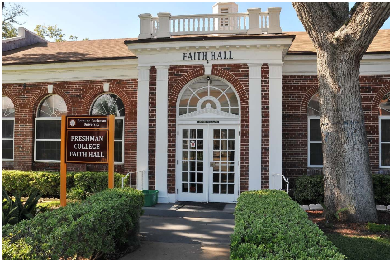
Historical Faith Hall; Administrative Offices for Freshman College

Information regarding academic programming at the University is found on the following pages. Additional information may be obtained from the deans and department chairs of each academic school. The University reserves the right to withdraw or modify any course or to change instructors of courses as deemed necessary. Class locations are included on the registration schedules that are provided to students each Semester and are posted on the University's website.