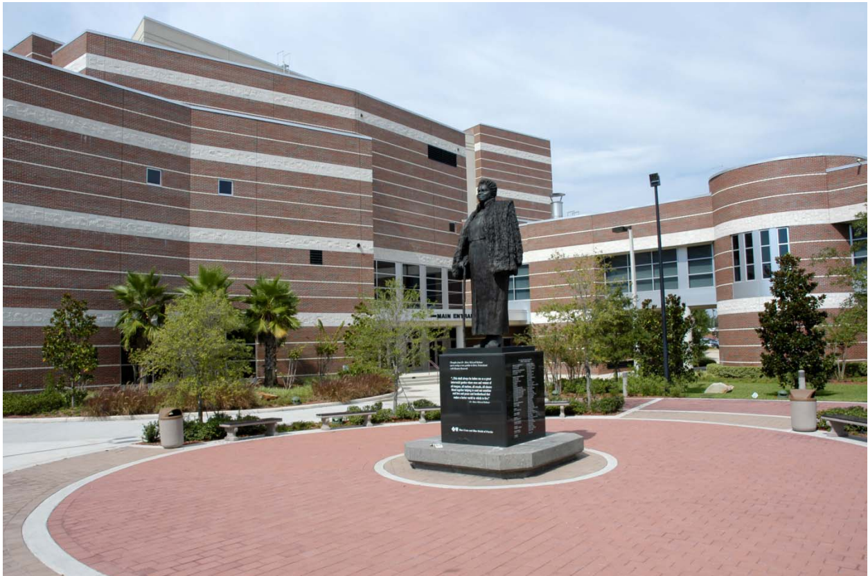
The statue of Dr. Mary McLeod Bethune is located in the Centennial Gardens on the Bethune-Cookman University campus.