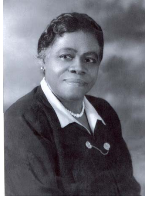
Dr. Mary McLeod Bethune (1875-1955) Founder and President (1904-1942; 1946-1947)