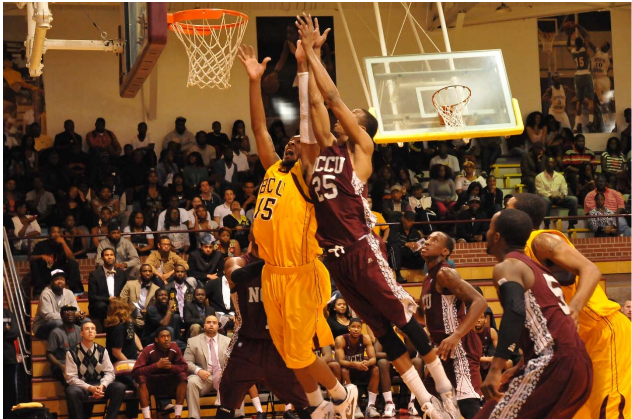
Wildcats in a Basketball Contest