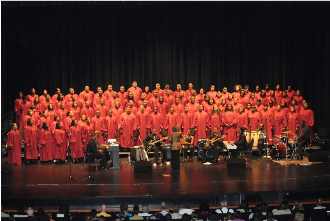
Bethune-Cookman University Concert Chorale