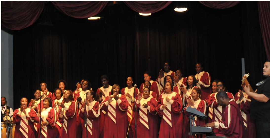
Bethune-Cookman University Inspirational Gospel Choir